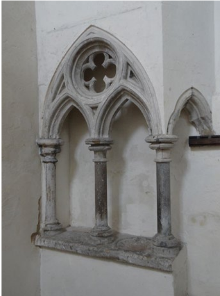
Piscina and Sedilia