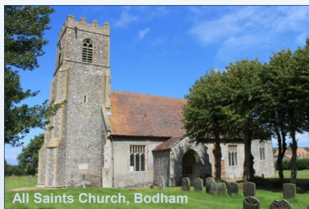
All Saints Church, Bodham

Inside, there is a medieval font with several memorials and nave benches that originally came from Beckham Workhouse chapel.