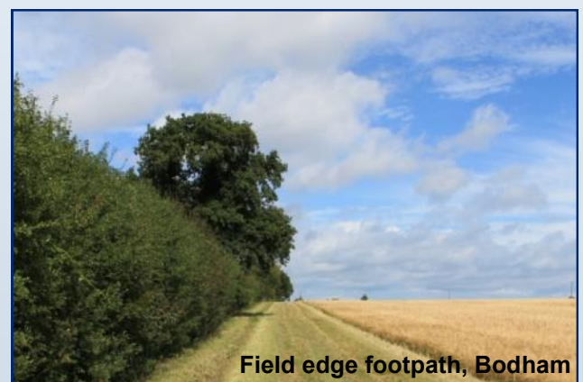
Field edge footpath, Bodham

The Red Hart Inn , on The Street in Bodham is close to the start and finish of the walk. This old fashioned village pub, with a log fire in the winter, offers a range of food from snacks to a full menu. Dogs are welcome.